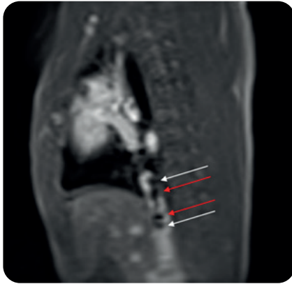
Figure 2: Low field (0.55 Tesla) CMR still frame showing MagnaFy® markers (white arrows) placed at the ends of the tapered tips of the 20 mm x 3 cm Z-Med balloon well distinguished from ends of crimped 26 mm long Mega LD stent (red arrows).

If low field MRI is going to be used clinically for ICMR in the future, further development and optimization of cardiac and interactive real-time imaging techniques is required to overcome the limitations of low signal-to-noise ratio and limited gradient performance. Fortunately, pre-clinical and clinical testing has already shown that a comprehensive CMR imaging protocol is feasible, including compressed-sensing 2D phase-contrast cine, dynamic contrast-enhanced imaging for myocardial perfusion, 3D MR angiography, and late gadolinium enhanced tissue characterization (10).